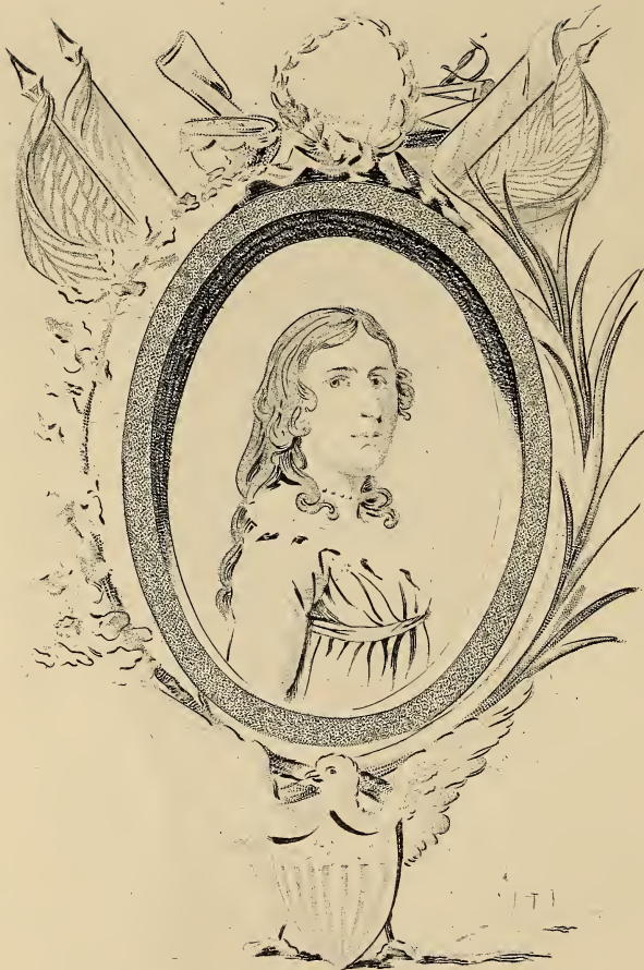
DEBORAH SAMPSON. Published by H. Mann. 1797.